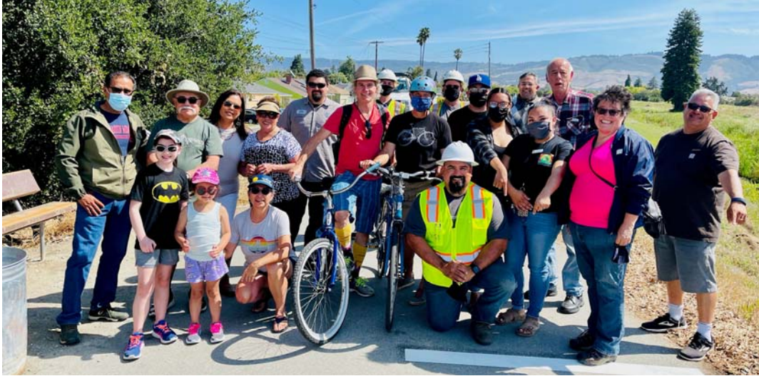
Mile marker installation on the Salsipuedes levee.